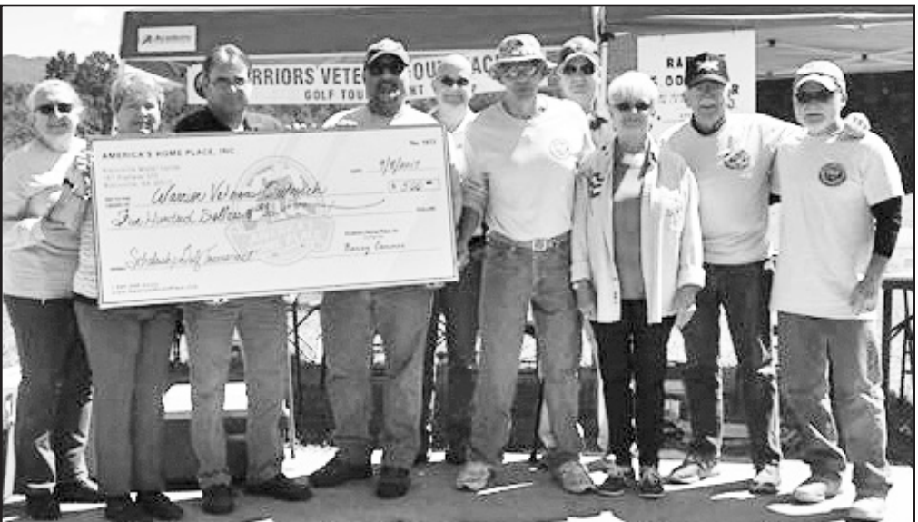
Warriors Veteran Outreach Golf Tournament was held on September 8th at the Old Union Golf Course. America's Home Place of Blairsville is proud to provide The Warriors Veteran Outreach a $500 donation to help our Veterans. Thank you for your service! NT(Sep27,22)CA