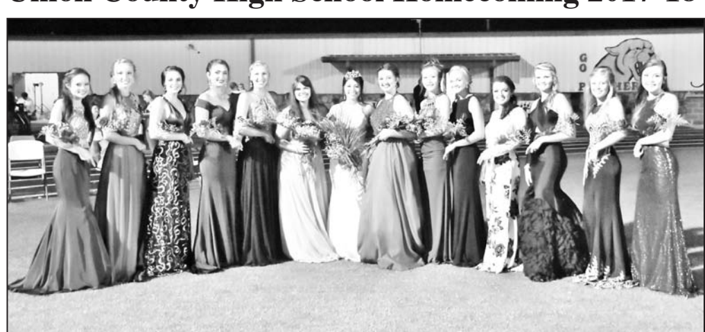
The Union County High School 2017-18 Homecoming Court.